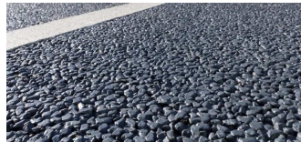
NEW LAYING WITH SOUND ABSORBING ASPHALT

DECREASE OF WIDTH OF LANE WITH THE INTRODUCTION OF TWO PEDESTRIAN CROSSING EQUIPPED WITH "SAFETY ISLANDS"