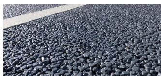
NEW LAYING WITH SOUND ABSORBING ASPHALT

DECREASE OF WIDTH OF LANE WITH THE INTRODUCTION OF TWO PEDESTRIAN CROSSING EQUIPPED WITH "SAFETY ISLANDS"