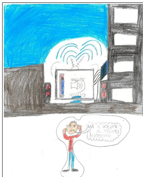
Winners of the competition "The most annoying noise of my city" of the class 3°B - School Gianni Rodari