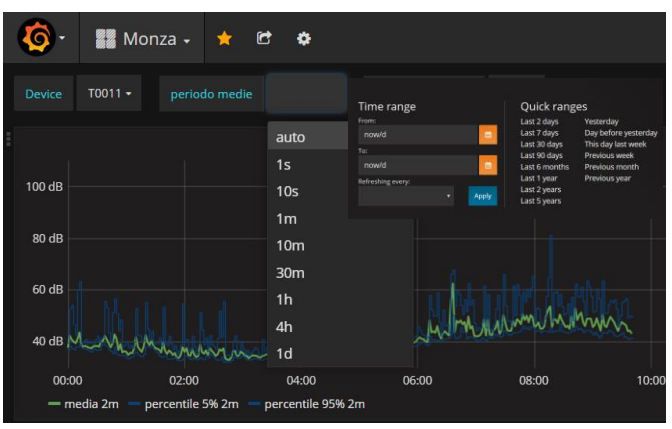
Figure 3. Web interface with possibility of selecting the time period to view and/or download.

A web interface (Figure 3) has been developed aiming to make possible to view and download data referred to a user-defined time period.