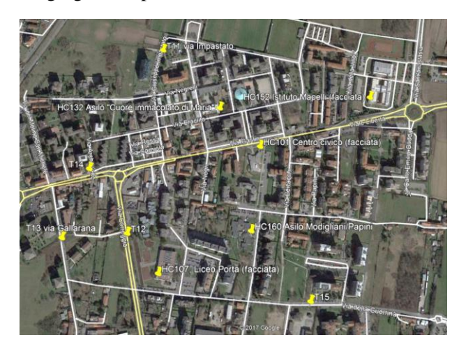
Figure 2. Site plan with the identification of noise monitoring stations.

From a practical point of view, 10 monitoring stations are expected to be installed in the pilot area of Libertà district, as illustrated in Figure 2. In particular, 2-3 microphones will be placed along the Viale Libertà, the main street where the traffic flow mix is expected to mainly change from ante to post operam scenario. The other microphones will be uniformly distributed along other streets belonging to the pilot area.