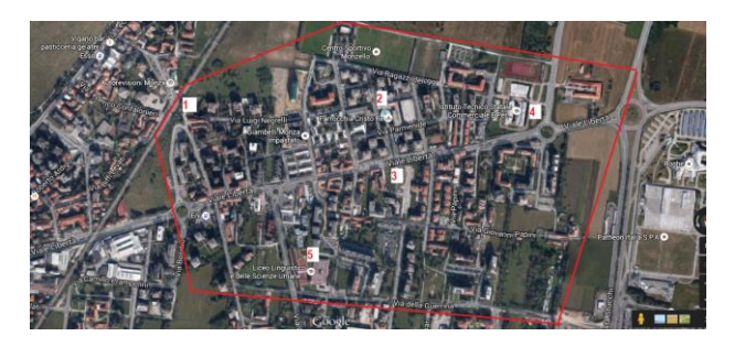
Figure 1. Perimeter of the pilot area ("Libertà" district, city of Monza).

According to what already defined in [4] the pilot area to be monitored consists of a district of the city of Monza as shown in Figure 1.